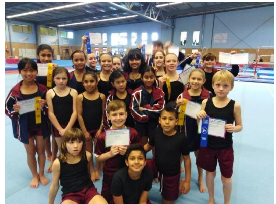
Pictured below are the students who represented the school at the Central West Gymnastics Competition - Results follow

Anyone from anywhere can do this so please help the school by mentioning this to your friends!